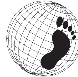
GLOBAL PIONEER SPIRIT WALKATHON